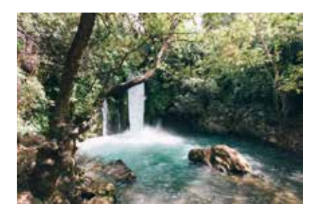
Cover: Ein Gedi Oasis, Israel.

He is a trained volunteer on ambulances and has been made a member of the Order of St John in recognition of this.